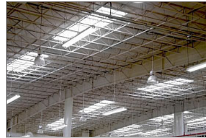
Installed High-Efficiency Lighting